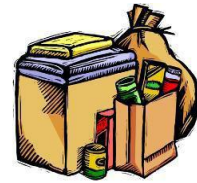
Food Pantry Donations Needed

Distribution is on the 2 nd Saturday of the month.