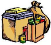
Food Pantry Donations Needed