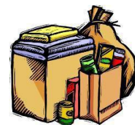
Food Pantry Donations Needed

The monthly drive items for May is canned vegetable or fruit. Toiletries are always welcomed. Please send $ donations to the Pine Plains Food Locker 2852 Church Street Pine Plains, NY 12567 Distribution is on the 2 nd Saturday of the month.